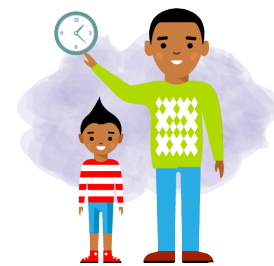
Structure and Discipline

Learning and practicing behavior therapy requires time and effort, but it has lasting benefits for the child. Ask your doctor about the benefits of parent training in behavior therapy for young children with ADHD.